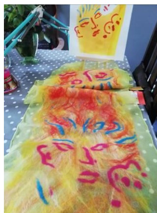
Carmen Art Auction