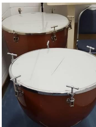
'Charisma' and 'Thunder'