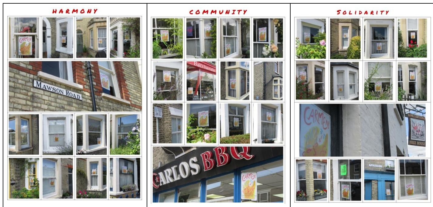
Thanks to everyone who helped make Carmen a success – not least the 49 households in Mawson Road who displayed a poster.