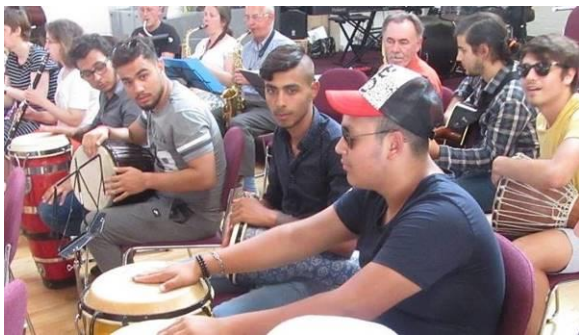
Turkish Delight – part of the afternoon was taken up with sharing music with a group of young musicians from Turkey and the ‘Music beyond Barriers’ project (Balik Arts).