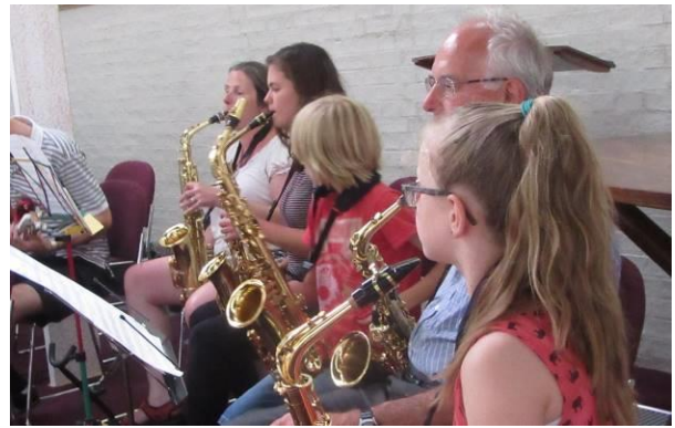
‘All Blues’ Jazz Workshop – was a jazz improvisation workshop based on All Blues - the famous Miles Davis number (known to many because it is a set-work on the Edexcel GCSE syllabus). This workshop was run in conjunction with the Cambridge Jazz Festival.