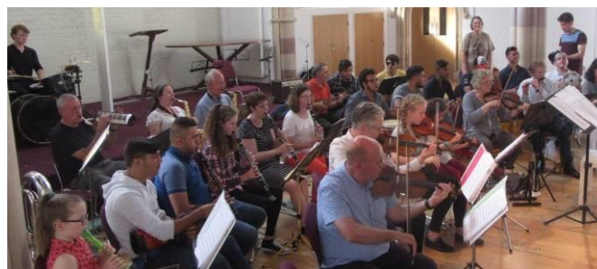
CMT’s Community Orchestra. The orchestra played a wide range of music including a selection of Turkish-inspired repertoire. pieces which the musicians from Ankara joined in with.