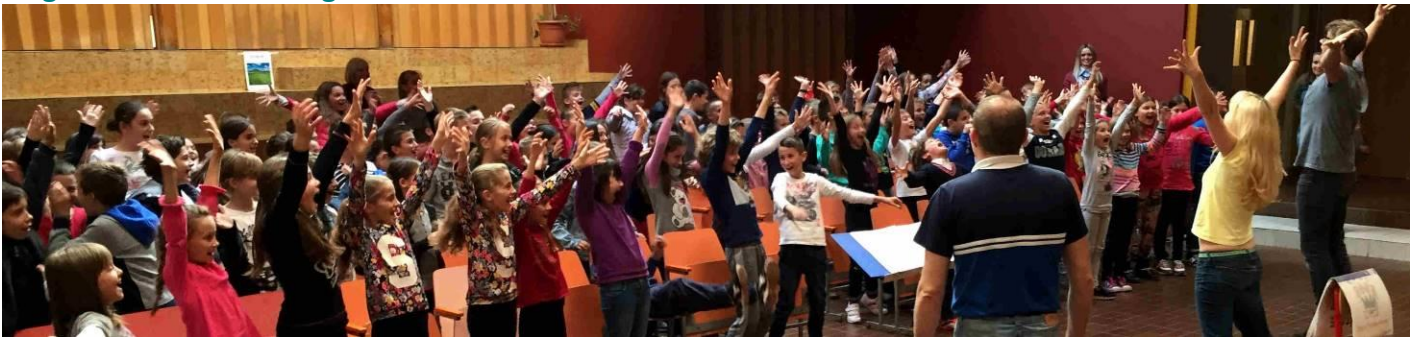
Children from the school XI Osnaovna Skola "S.S. Kranjcevic"